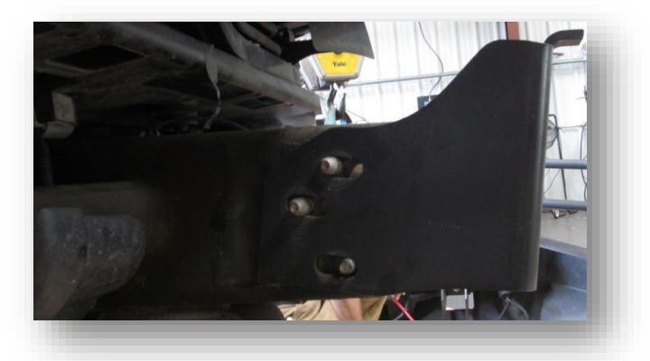
Figure 11: Inside side view of driver side frame mount