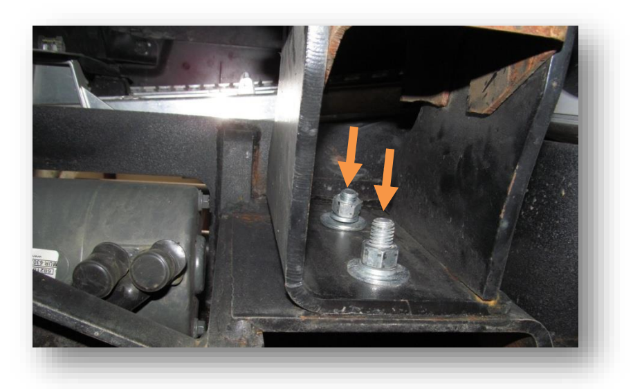
Figure 14 Congratulations!