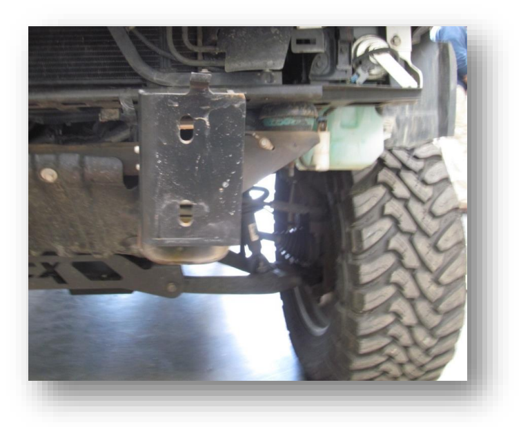
Figure 9: front view of driver side mount.

1. Align frame mounts to vehicle. See figure 9, figure 10, and figure 11. Use bolt strip and tow hook bolt to hold frame mount in place.