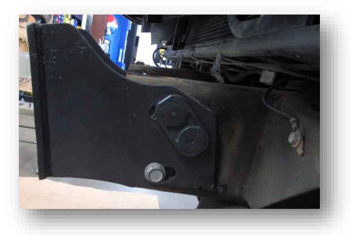
Figure 10: Outside side view of driver side frame mount