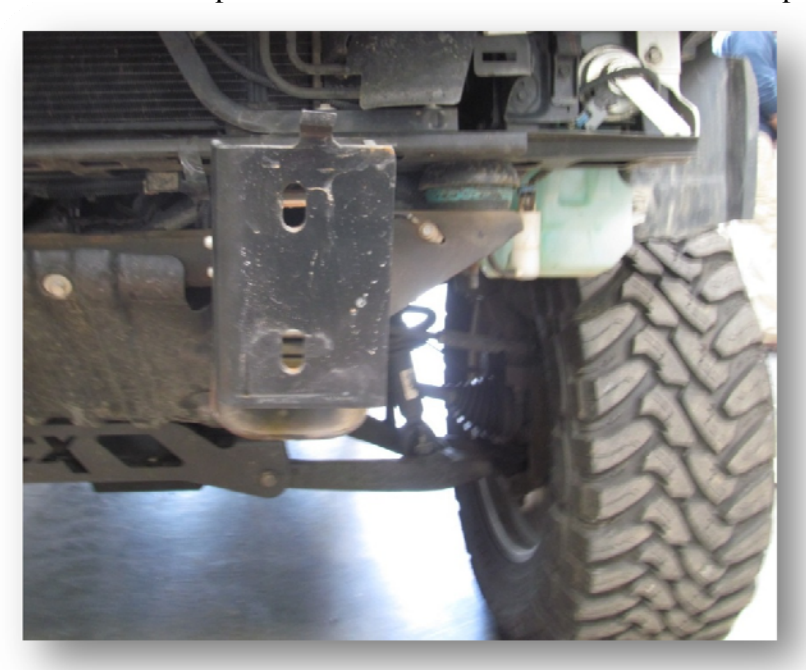
Figure 9: front view of driver side mount.

1. Align frame mounts to vehicle. See figure 9, figure 10, and figure 11. Use bolt strip and tow hook bolt to hold frame mount in place.