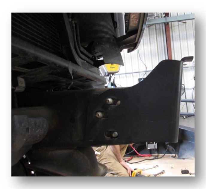
Figure 11: Inside side view of driver side frame mount