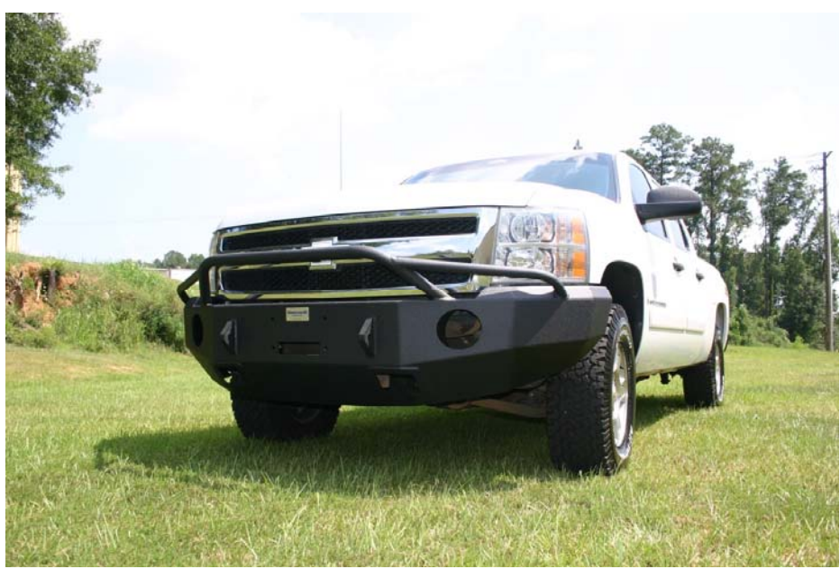
Congratulations! Your bumper installation is now complete. Thank you for your purchase.