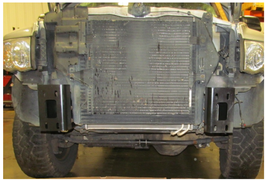
FIGURE 7: FRONT VIEW