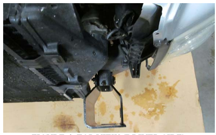
FIGURE 6: TOP VIEW (DRIVER SIDE)