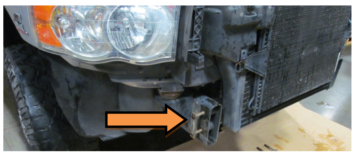
FIGURE 3: POSITION OF BOLT STRIP ON PASSENGER SIDE

3. REMOVE TWO 18 MM NUTS THAT HOLD ON THE BOLT STRIP(BOTH SIDES)SEE FIGURE 3 AND FIGURE 4.(ON DIESEL CAREFULLY SLIDE INTERCOOLER AS FAR AWAY FROM EACH SIDE THAT IS BEING REMOVED)