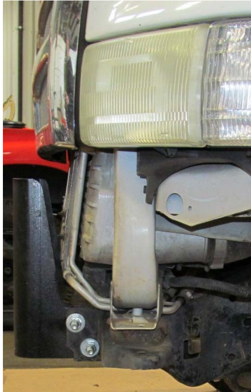
FIGURE 8: OUTSIDE VIEW OF FRAME MOUNTS