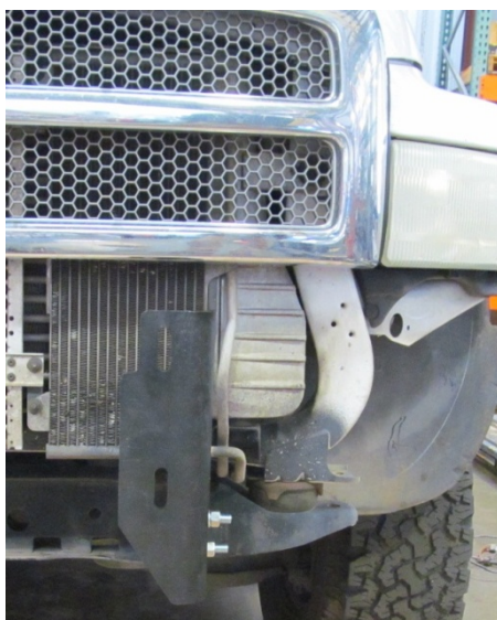
FIGURE 7: FRONT VIEW OF DRIVER SIDE FRAME MOUNT