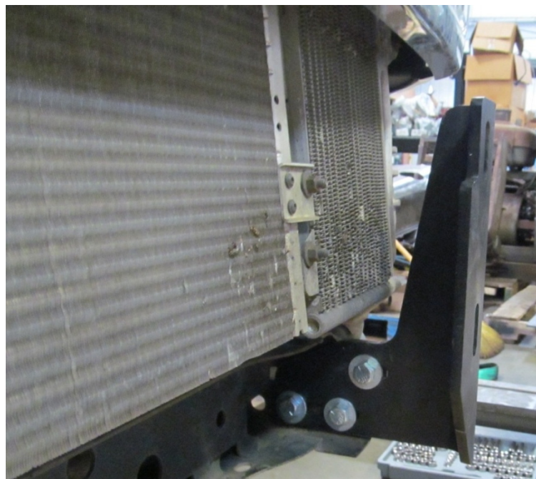
FIGURE 9: INSIDE VIEW OF FRAME MOUNTS