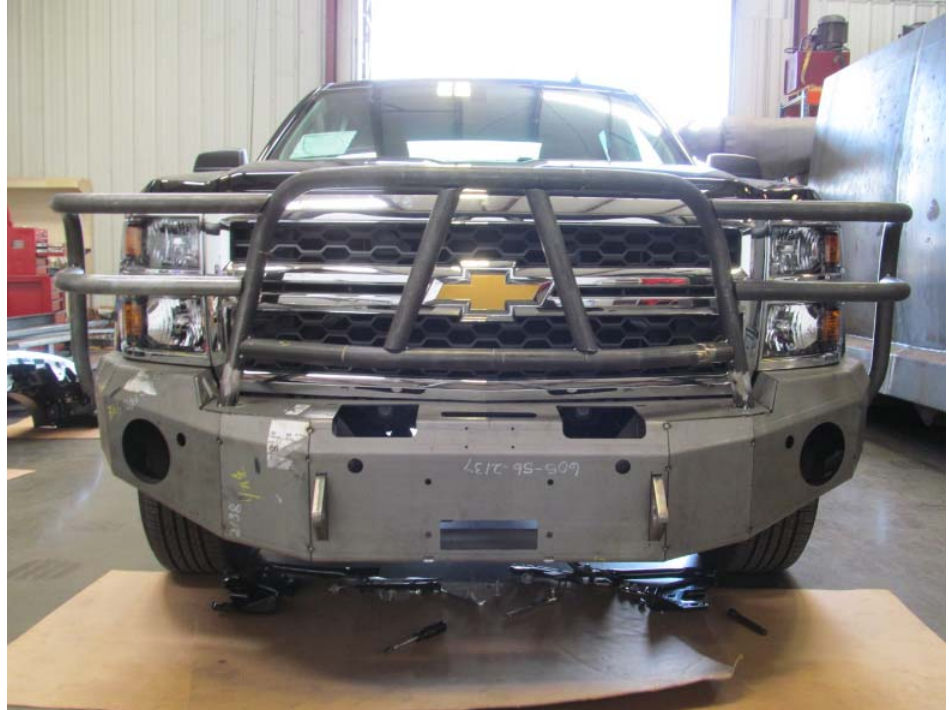
Congratulations! Your installation is now complete. Thank you for your purchase.