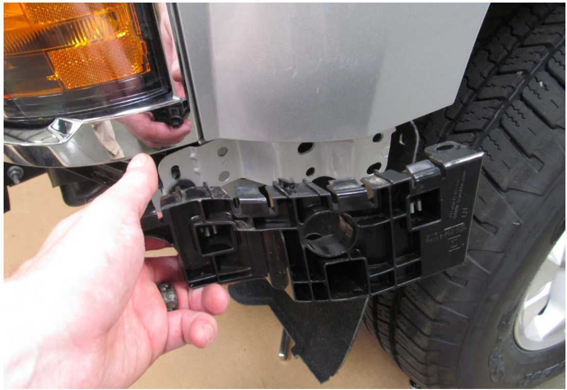
16. Remove two screws holding on plastic trim under headlight with T15 Torx bit. Set bracket aside. (both sides)