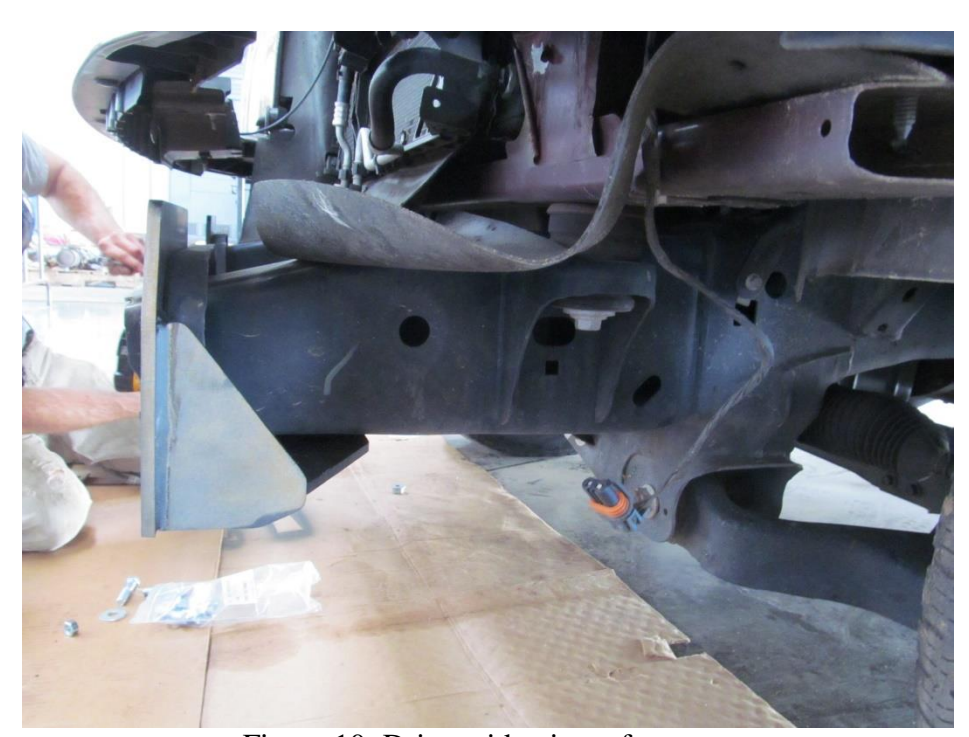
Figure 10: Driver side view of mounts