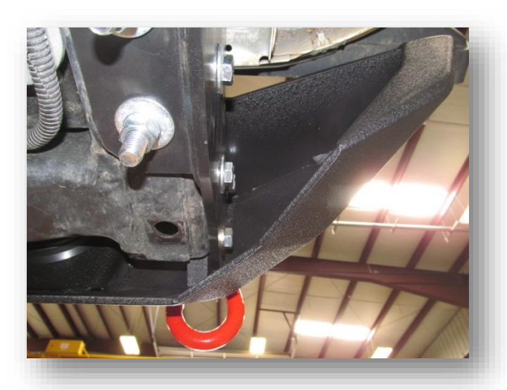
Figure 18 12. Using two ½" -13 bolts per side from Hardware kit # 4 hand tighten bolts from frame mount into shackle mount of bumper. See Figure 19

11. Install HammerHead bumper onto the frame mounts. The bumper attached to the inside of the frame mounts. See Figure 18.