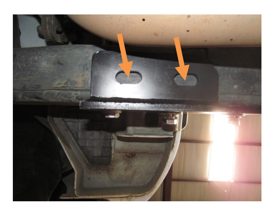
Figure 14: Underneath view of passenger side frame mount.

4. On the passenger side only Use a center punch to mark two holes in the center of the holes on the bottom flange of the Hammer Head frame mount. See Figure 14.