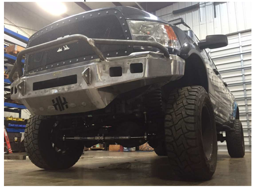
Congratulations! Your bumper installation is now complete. Thank you for your purchase.