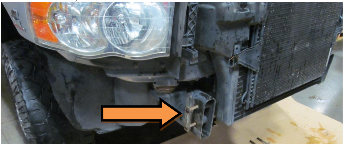
FIGURE 3: POSITION OF BOLT STRIP ON PASSENGER SIDE

3. REMOVE TWO 18 MM NUTS THAT HOLD ON THE BOLT STRIP(BOTH SIDES)SEE FIGURE 3 AND FIGURE 4.(ON DIESEL CAREFULLY SLIDE INTERCOOLER AS FAR AWAY FROM EACH SIDE THAT IS BEING REMOVED)