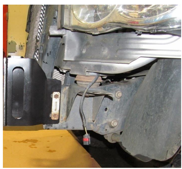
FIGURE 5: SIDE VIEW (DRIVER SIDE)

1. POSITION FRAME MOUNTS AS SHOWN IN FIGURES 5,6, AND 7. AND TIGHTEN THE 2 18MM NUTS ON THE BOLT STRIPS (BOTH SIDES)