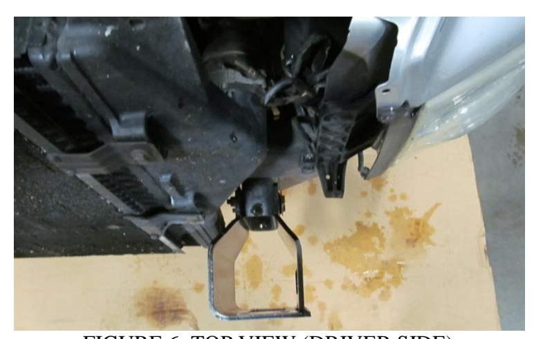
FIGURE 6: TOP VIEW (DRIVER SIDE)