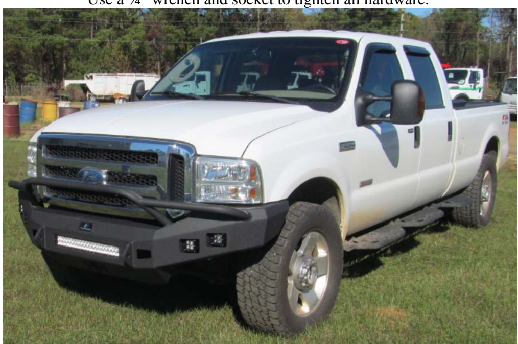
Congratulations! Your bumper installation is now complete. Thank you for your purchase.

Align bumper a minimum of ¼" below headlights. When truck flexes off-road, this distance allows your bumper and body to have clearance. Use a ¾" wrench and socket to tighten all hardware.