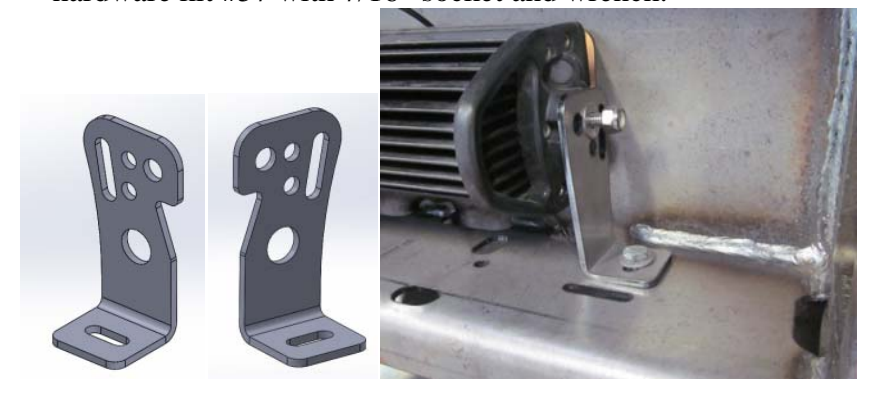
2958 and 2959 brackets

1. Install all lights in Hammerhead bumper at this time. Use included Bar mount brackets (601-56-2958 and 2959) and Hardware kit #57 to attach 20" bar in bumper to mount in bumper. Use hole in bracket and bumper that works best with your light bar. Tighten bolts from hardware kit #57 with 7/16" socket and wrench.