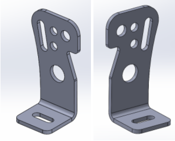
2958 and 2959 brackets

bracket and bumper that works best with your light bar. Tighten bolts from hardware kit #57 with 7/16" socket and wrench.