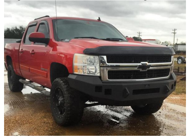
Congratulations! Your bumper installation is now complete. Thank you for your purchase.

5. Trim plastic fender wells to match bumper. (both sides)