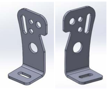
2958 and 2959 brackets

1. Install all lights in Hammerhead bumper at this time. Use included bar mount brackets (601-56-2958 and 2959) and Hardware kit #57 to attach 20" bar in bumper to mount in bumper. Use hole in bracket and bumper that works best with your light bar. Tighten bolts from hardware kit #57 with 7/16" socket and wrench.