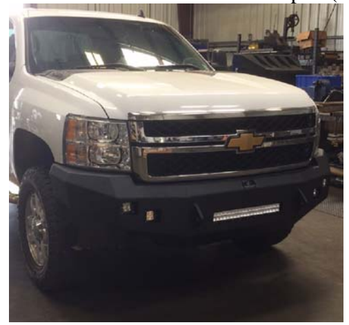
Congratulations! Your bumper installation is now complete. Thank you for your purchase.

5. Trim plastic fender wells to match bumper. (both sides)