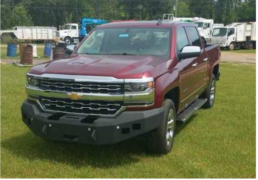
Congratulations! Your installation is now complete. Thank you for your purchase.