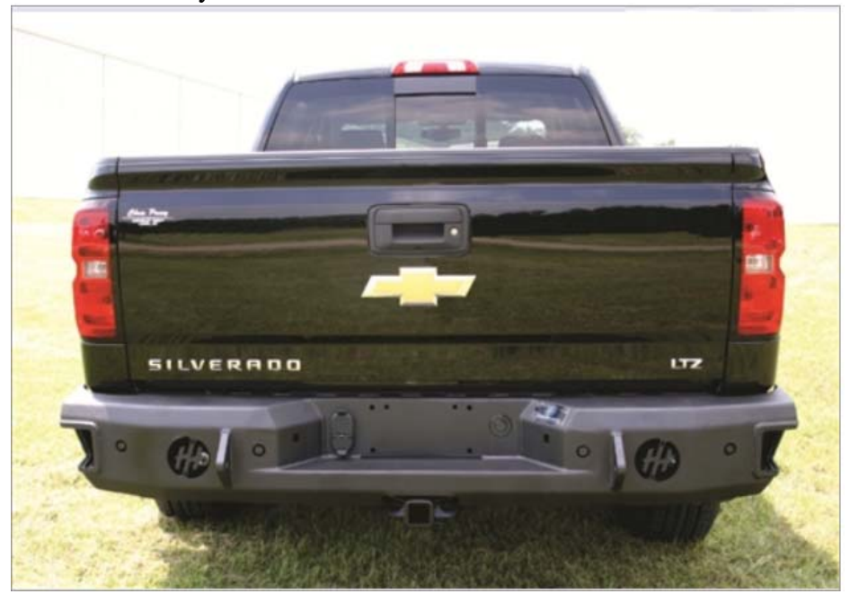
Congratulations! Your product installation is now complete. Thank you for your purchase.

8. Install bumper on frame mounts using hardware kit # 1. Align bumper horizontally and vertically. Tighten nuts using 3/4" socket. Note: Open tailgate slowly to ensure minimum of 3/8" clearance below tailgate and minimum of 3/8" clearance from truck body.