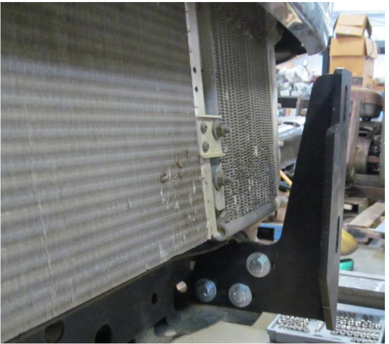
FIGURE 9: INSIDE VIEW OF FRAME MOUNTS