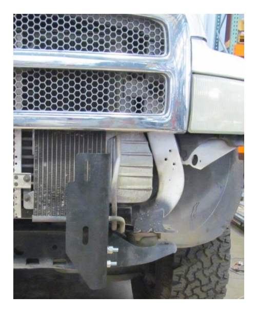
FIGURE 7: FRONT VIEW OF DRIVER SIDE FRAME MOUNT

1. Align frame mounts to INSIDE of frame. See figures 7, 8, and 9.