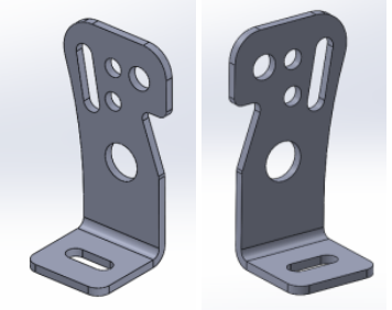
2958 and 2959 brackets