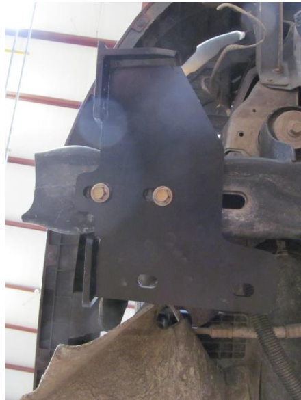
Figure 8: Bottom view of mount