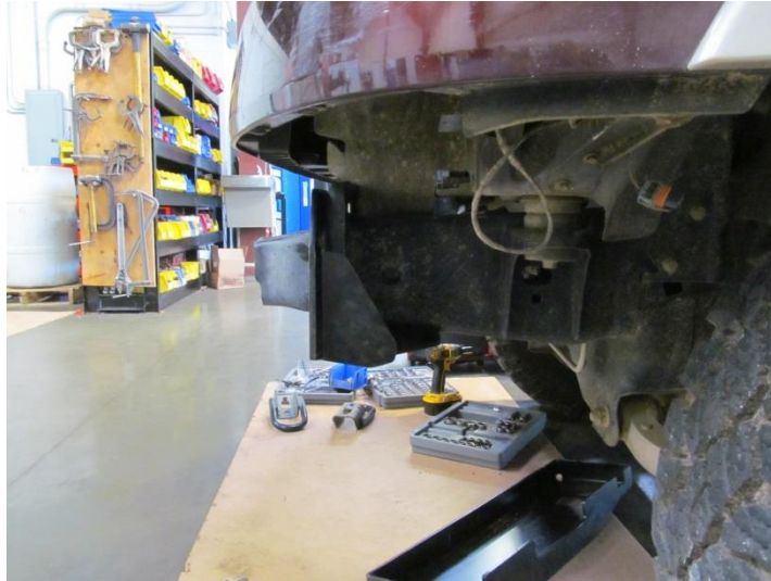
Figure 9: Side view of mount