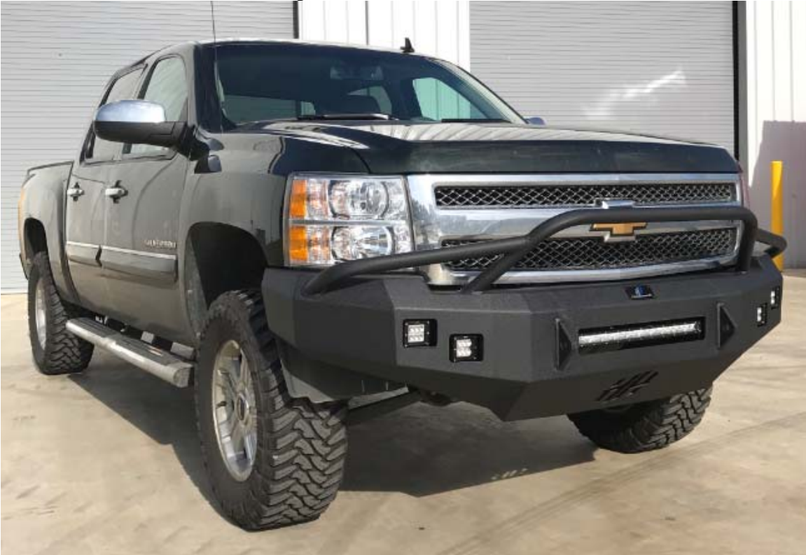
Congratulations! Your bumper installation is now complete. Thank you for your purchase.