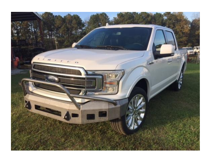
Congratulations! Your product installation is now complete. Thank you for your purchase.

4. Using a hoist or a few friends, attach bumper to frame mounts hardware kit #53, and 1 weld nut tab per side. Start all bolts before aligning bumper. Align bumper a minimum of ½" below plastic fascia. When truck flexes off-road, this distance allows your bumper and body to have clearance. Tighten bolts with ¾" socket and wrench. Tighten frame mount bolts at this time.