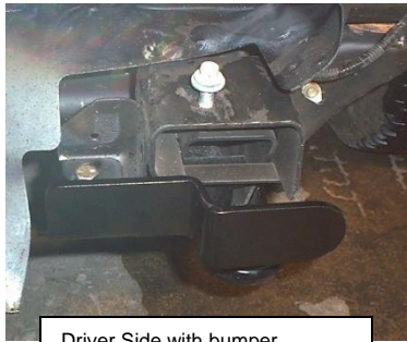
Driver Side with bumper support bracket installed