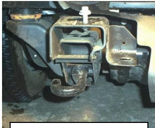
Passenger Side without bumper support bracket installed

Step 3: Align grille guard to truck and drill 1/2 inch hole through chrome bumper and bumper support bracket installed in step 1.