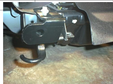
Passenger Side with bumper support bracket installed

Step 1: Remove lower bumper support bolt located on the engine side of frame. (Note: Do not remove factory bumper). Install Frontier bumper support bracket behind bumper and to the top of frame. Insert bolt and slide bumper support bracket forward to the backside of the chrome bumper. Tighten bolt. (Hint – Brackets should point away from each other when placed against the back of the factory bumper.)