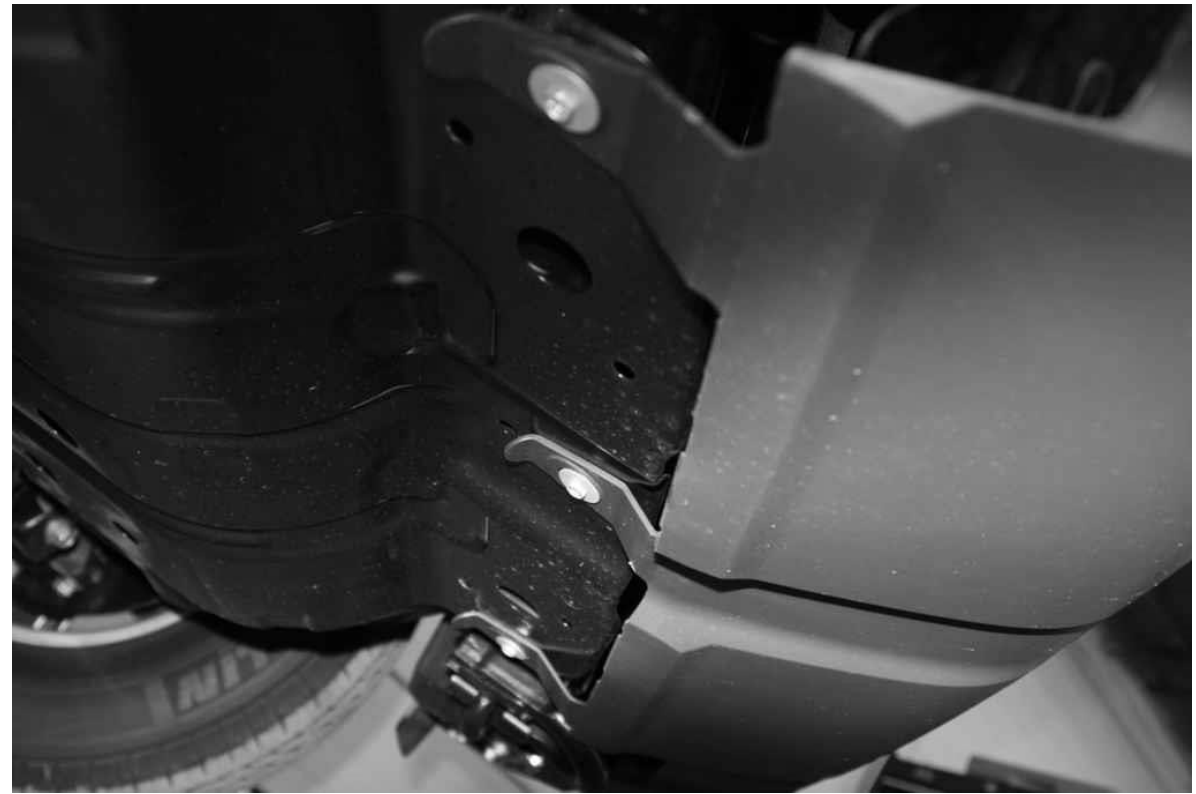
Figure 2 - Screw Locations

2. Using a Phillips Head screwdriver remove the three screws from the bottom plastic on the bumper. See Image Below.