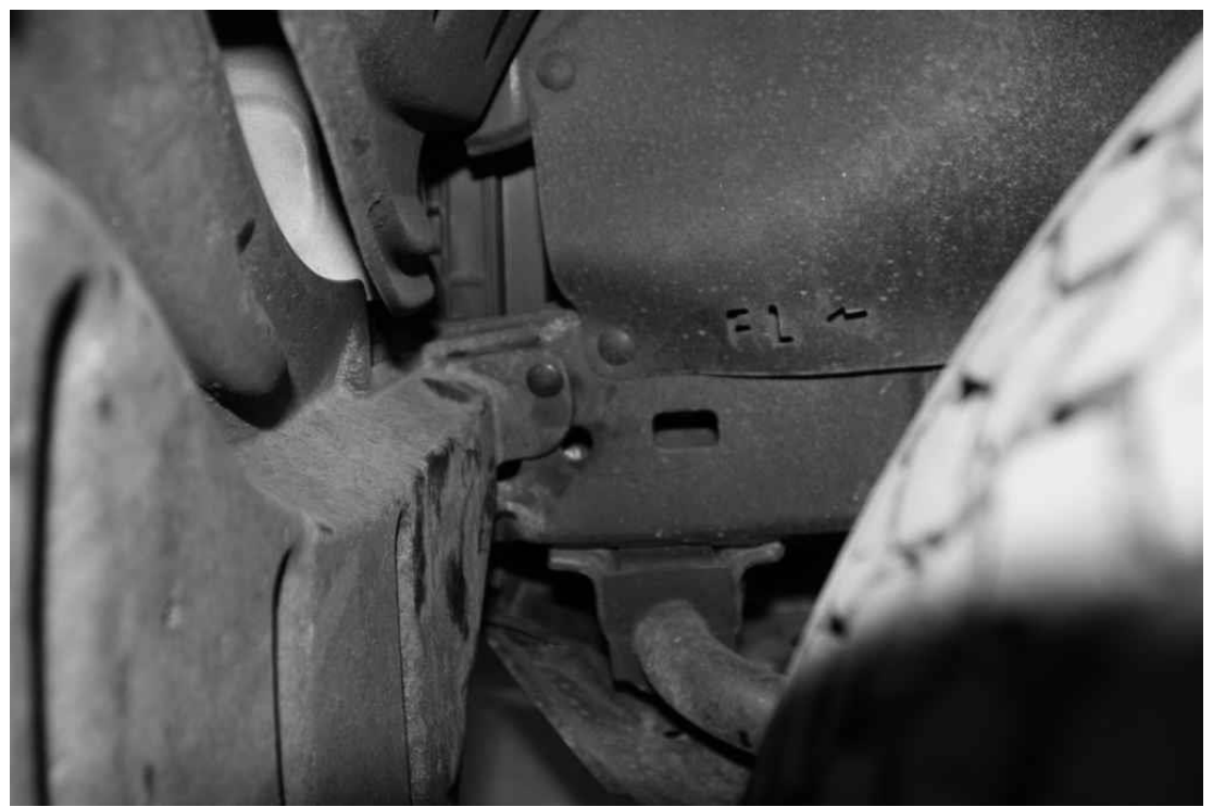
Figure 1 – Dart Clip Locations

1. Remove Dart Clip from front inner fender lining from frame. Complete both sides. See Image Below.