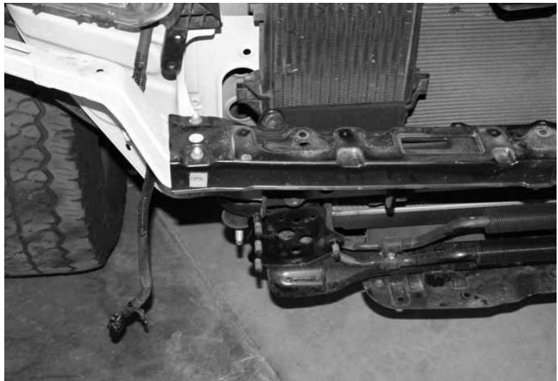
Figure 3 - Factory Bumper Connection

6. Using a deep 14mm socket and breaker bar, loosen the 4 14mm nuts located at the connection between the factory frame end and the bumper. See Image Below.