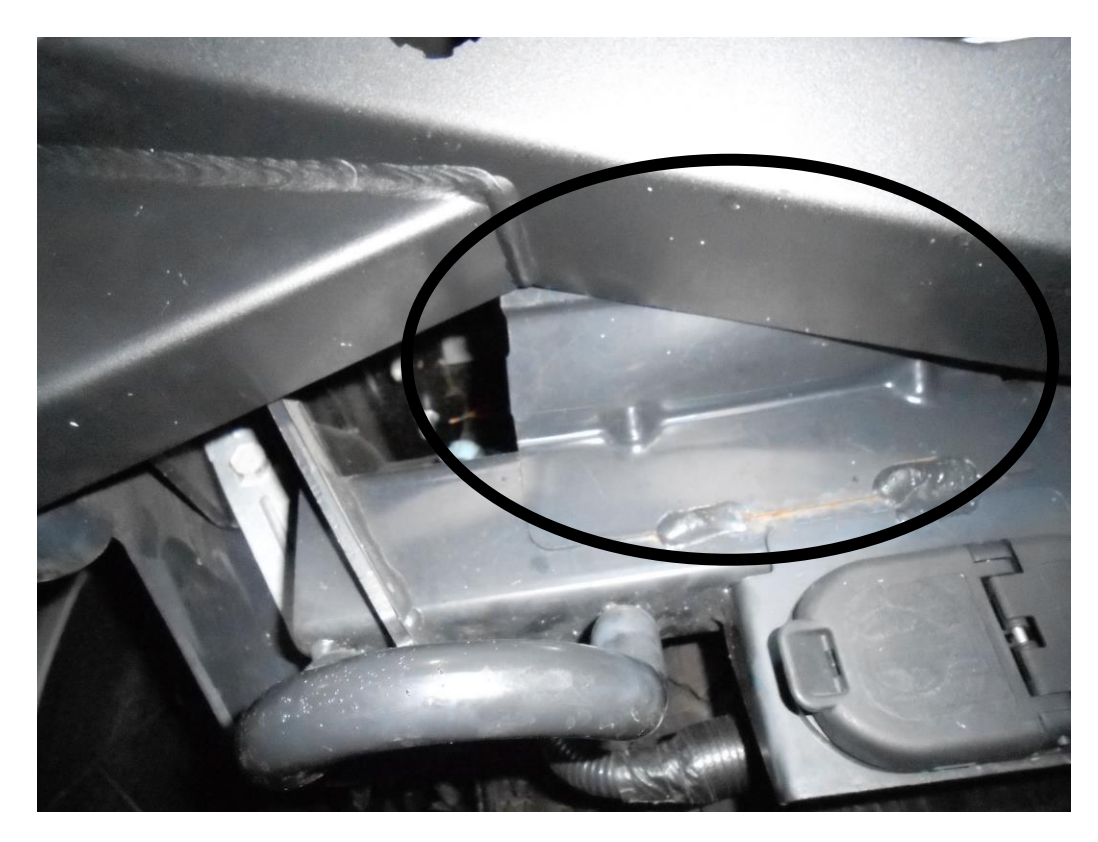
Figure 3 (image of bumper and hitch installed)

Product Number: E1751 Application: 10-14 Ford Raptor 2009-2014 F150