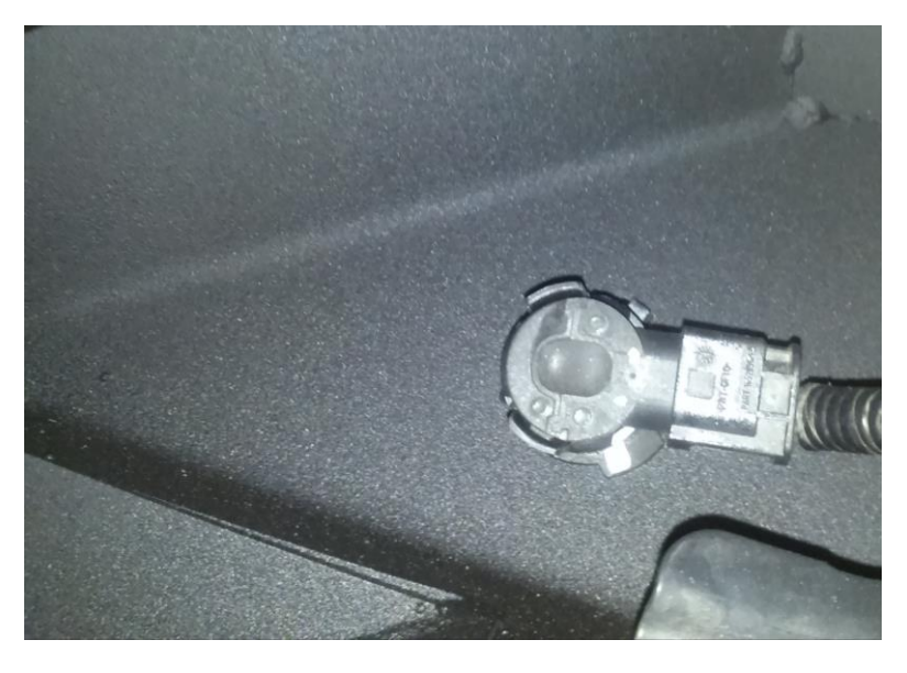
Figure 6a (inner passenger side: plug toward center of bumper)

Product Number: E1751 Application: 10-14 Ford Raptor 2009-2014 F150