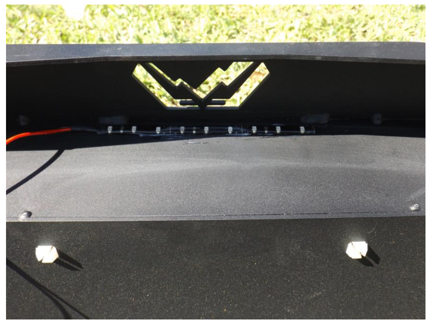
Figure 5 – LED Strip Location

G. Prep the area shown below and attach the red LED strip in the location shown. Wire as desired depending on functionality. You have the following options: wire to your brake lights, running lights or tag lights.