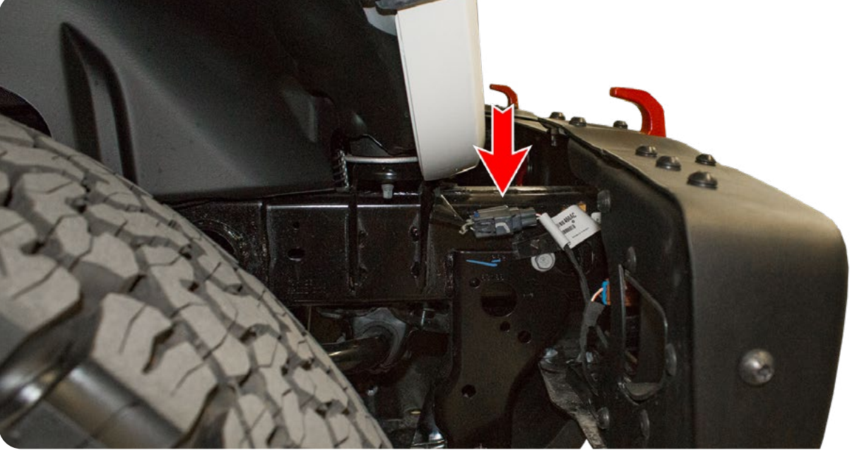
Page 3 | Addictive Desert Designs