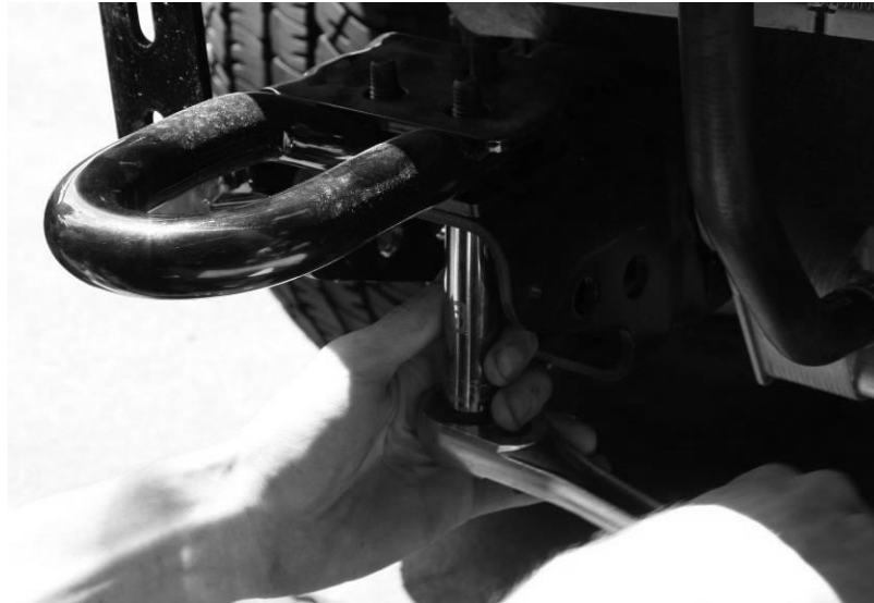
Figure 3 - Tow Hook Removal